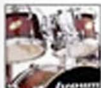
Ludwig Accent CS Custom Elite