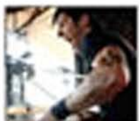
New Atom Willard Drum Part