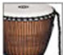
Meinl African Style Djembes