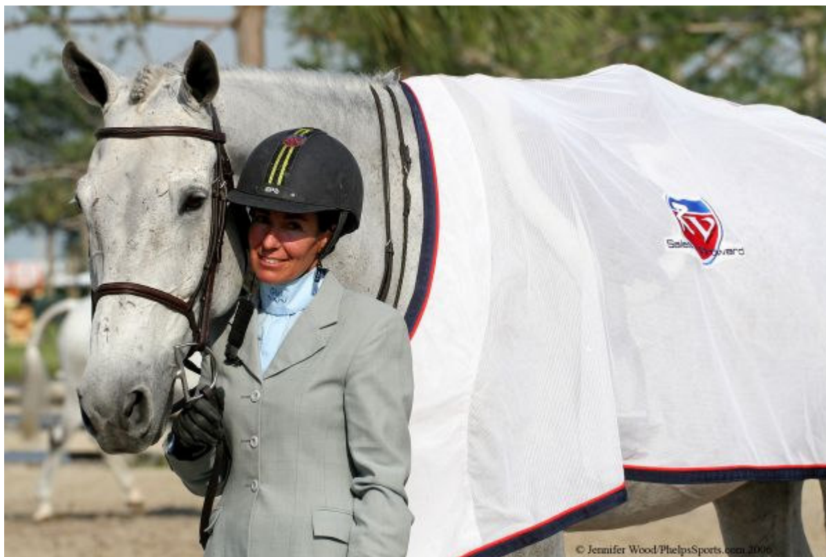
This photo may be used free of charge only in relation to this press release.